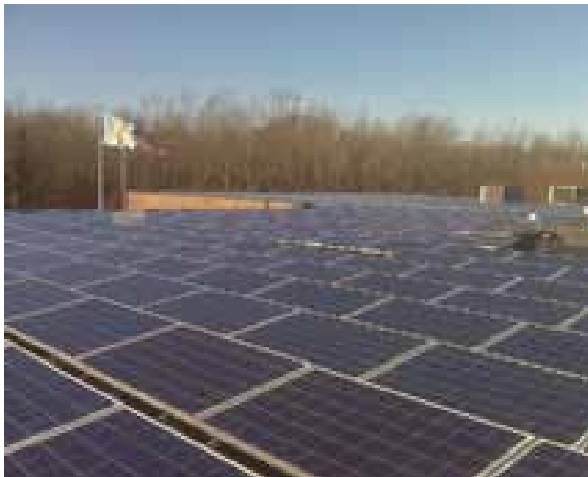
Solar panels on the roof of Delaware Transit Corporation's administration/maintenance building in Dover became operational on Dec. 12, 2011. The panels will produce 230,000 kilowatt hours per year. This saves 159 metric tons of carbon dioxide emissions annually, roughly equal to the emissions of 31 cars.

testing and inspection before utility connection and approval. The yearly electric usage at the Dover facility is