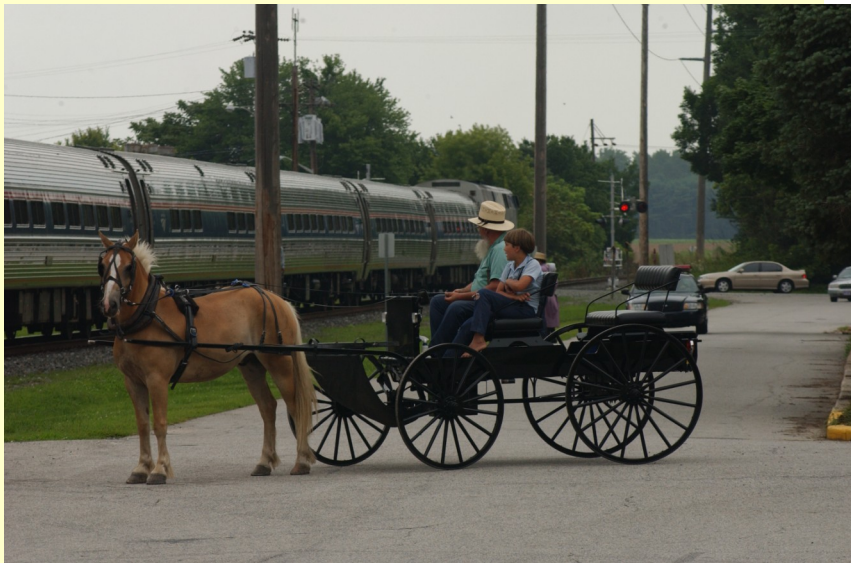
An Amish buggy waits in 2004 at a railroad crossing in Wyoming, as a Rail to the Fair train passes.

DTC. The Delmarva Rail Passenger Association (DRPA) remained an active volunteer supporter of Rail to the Fair until the excursion's last trip in 2007. Financial constraints were the major reason that ended the popular excursion. Although the first excursion nearly broke even cost-wise, future trips did not. Each station stop added to the financial burden and the addition of a food service car, though a welcomed amenity, also added to the overall cost.