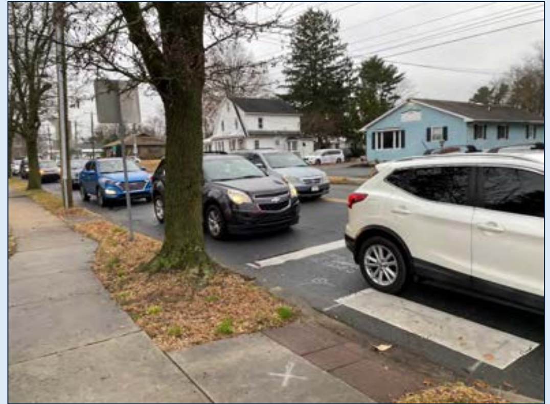
Queuing on South State Street