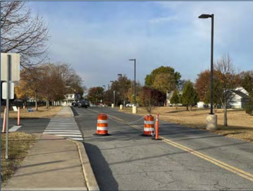
Internal Intersection at Parking Lot Entrance Functions Poorly